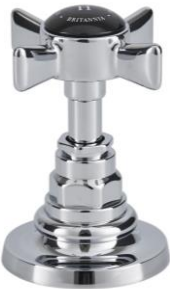
Code: 23044000 Price: R 120