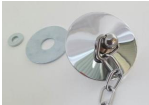
Tap hole stopper for chain