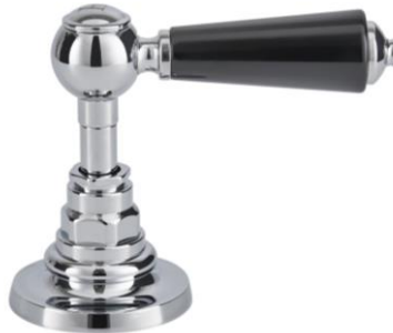
Code: 23504100 Price: R 650