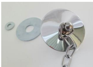
Tap hole stopper for chain