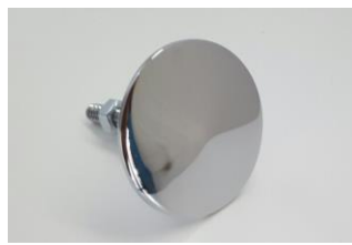
Plain tap hole stopper