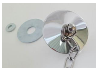
Tap hole stopper for chain