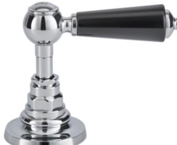
Deluxe Lever Black