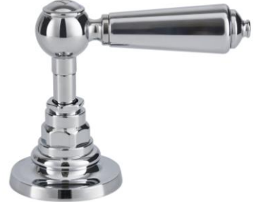
Deluxe Lever Chrome Insert