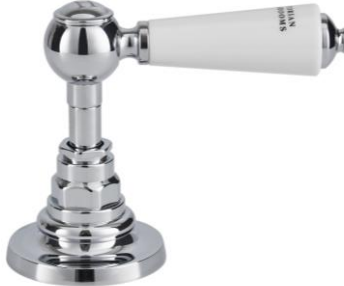
Deluxe Lever White