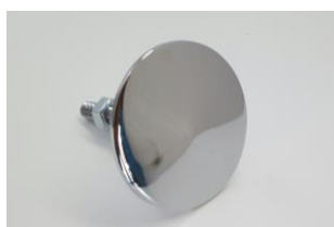
Plain tap hole stopper