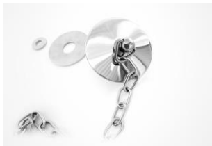
Tap hole stopper for chain