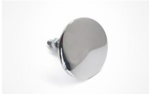
Plain tap hole stopper