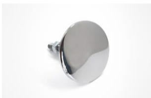
Plain tap hole stopper