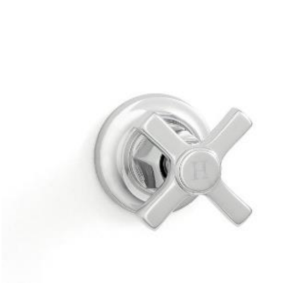
Arte cross handle

Available with either the Arte cross handle or lever: