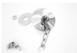
Tap hole stopper for chain