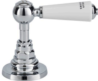
Deluxe Lever White