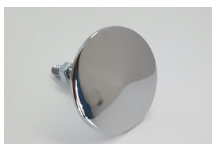
Plain tap hole stopper