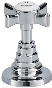
Traditional Cross Handle White

Please note that the pricing varies for the different tap head offerings.