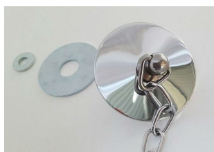
Tap hole stopper for chain