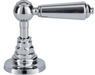
Deluxe Lever Chrome Insert