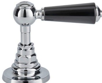
Deluxe Lever Black