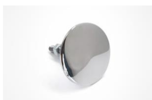
Plain tap hole stopper