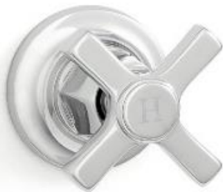
Arte cross handle

Available with either the Arte cross handle or lever: